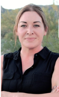
Lisa Gregory PLLC