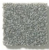
CARPET: BIG RANCH: ARTIC SHADOW CARPET PAD: 7LBS