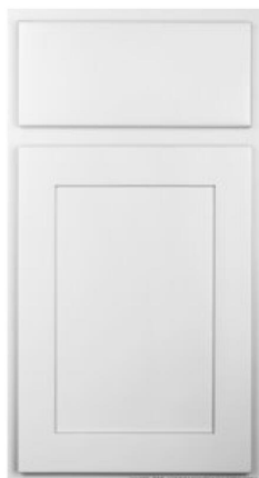
CABINET: DAKOTA: WHITE