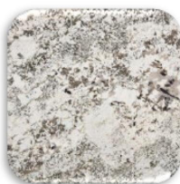
KITCHEN COUNTER: GRANITE: BIANCO TYPHOON EDGE: POLISHED FLAT