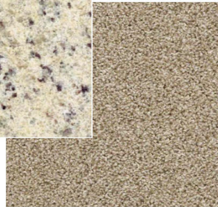
Carpet Flooring Shaw Arrendale