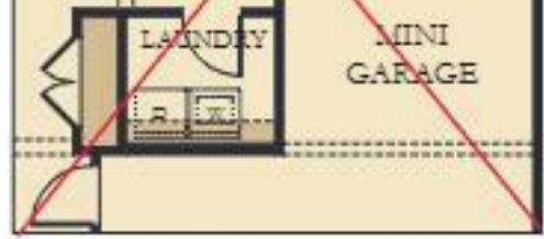
OPT. MINI GARAGE I.L.O. BEDROOM 4