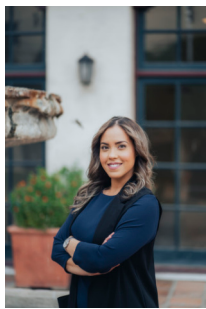
Betsabe Asencio - Gil

Stunning, energy efficient, one level Pepper Viner home under construction at Pinnacle Del Lago. The gourmet kitchen is part of soaring great room /dining area. the Avant is one of Pepper Viners most versatile plans. Includes a 3 car garage, all on 3/4 acre lot inside Vail's newest gated community . Convenient to shopping, golf, [...]